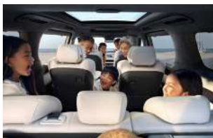
More than enough room for everyone with interior space of up to 7.4m 2 .