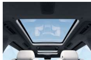
Large 2.16 m 2 panoramic sunroof with electric sunshade.