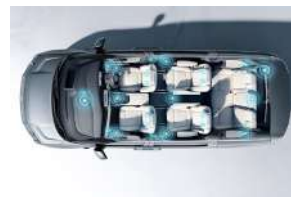
Yamaha 30 Speaker system combined with 17" OLED Display for movie streaming on the go.