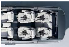
Triple-row child seat anchors with 4 ISOFIX interfaces.