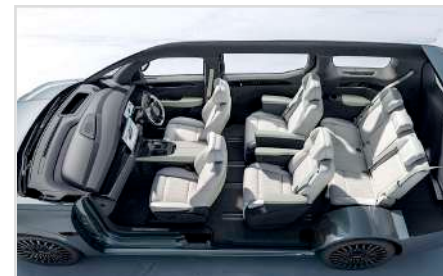
7-seats (2 : 2 : 3)